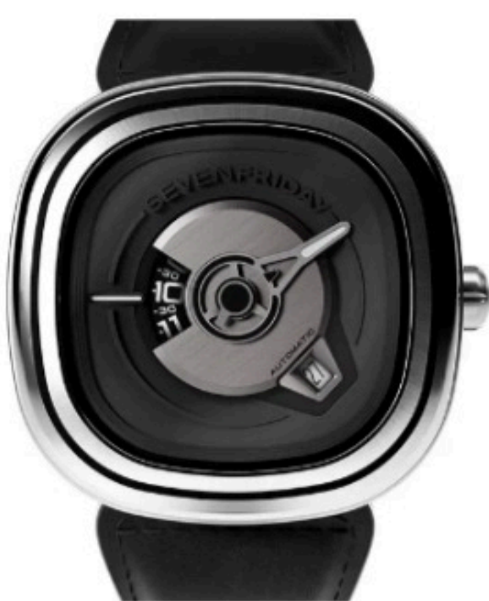
SevenFriday PE1/01 $1,265