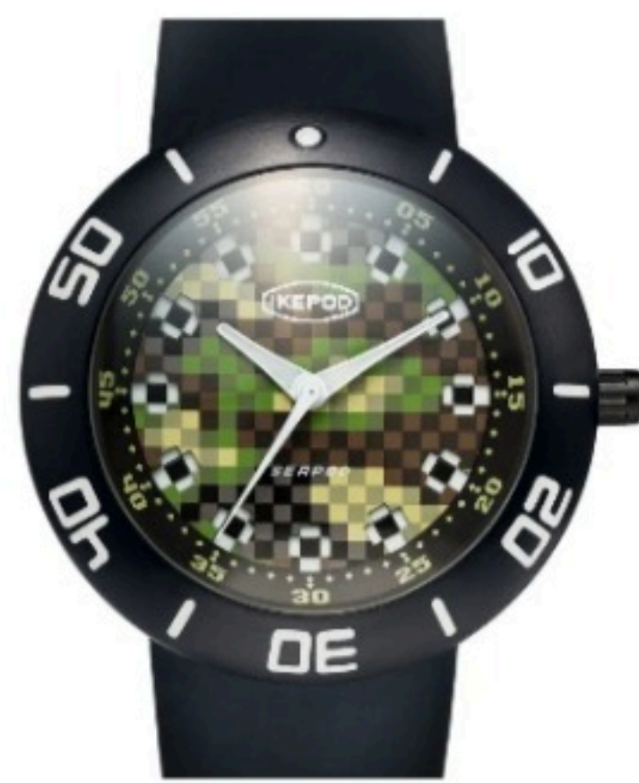
Ikepod Seapod Pixpat $1,795