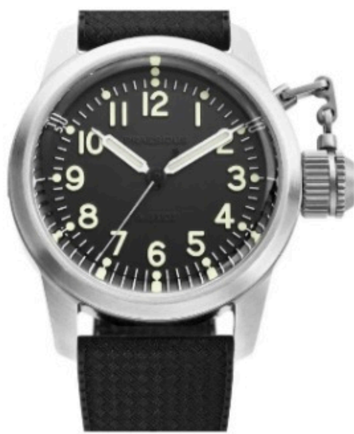
Praesidus A-5 UDT: Black Rubber Tropic $645