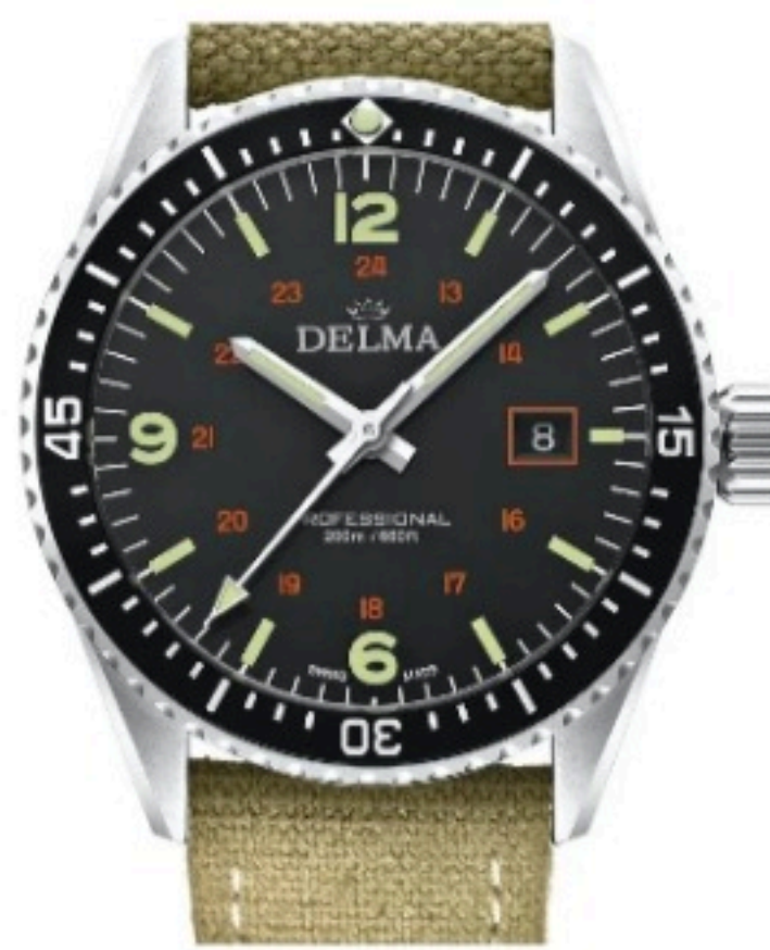
Delma Cayman Field $725