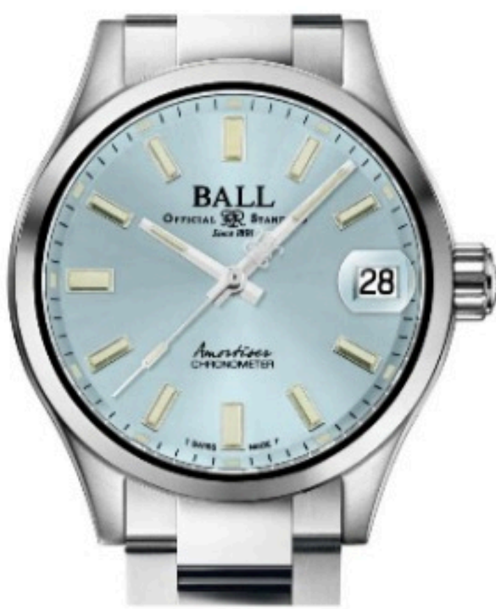
Ball Watch Engineer Master II Endurance 1917 $2,649