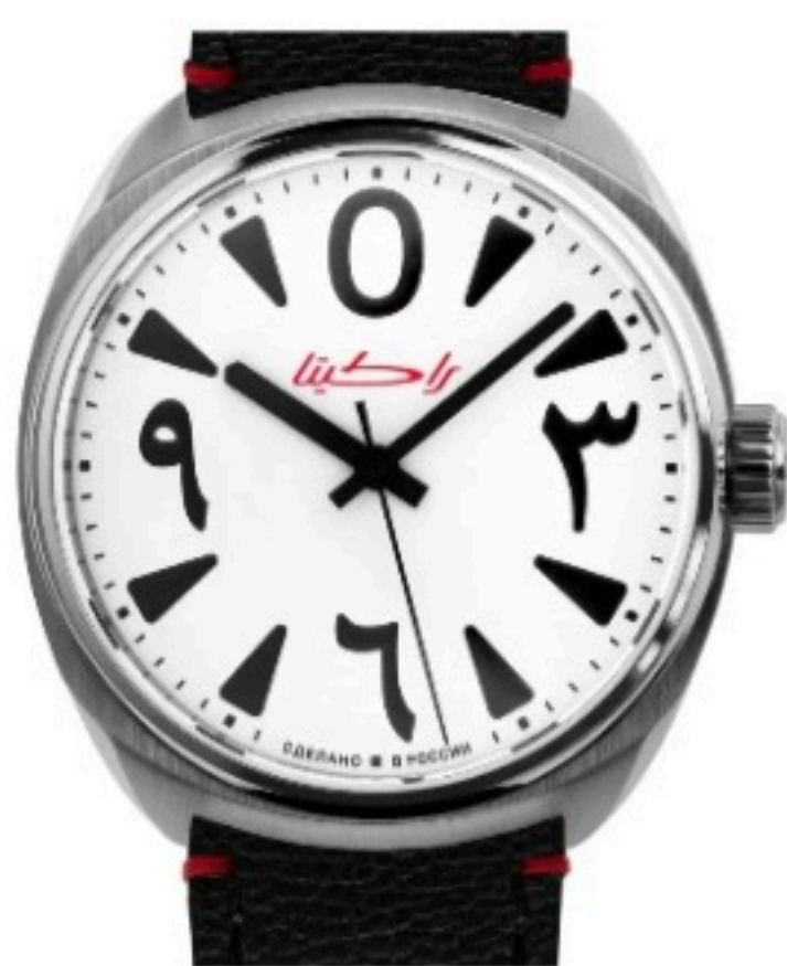
Raketa Classic "BIG ZERO" Arabic 0283 $1,550