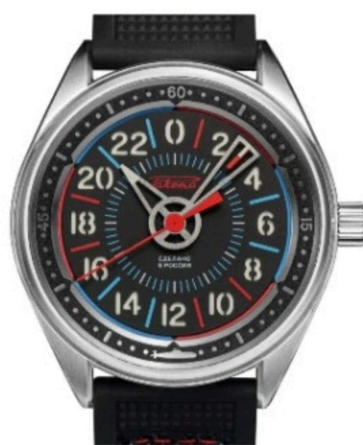
Raketa "Sonar" 0317 $1,900