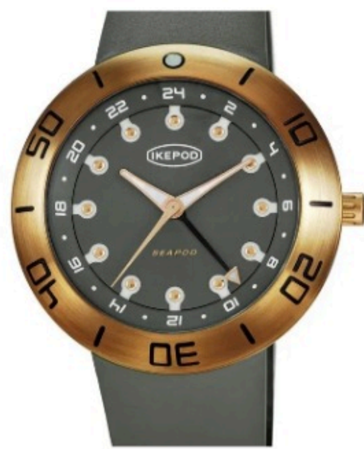
Ikepod Seapod Bronze GMT Archi $2,600