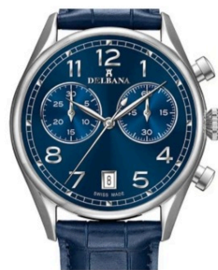
Delbana Florentino Chronograph $450