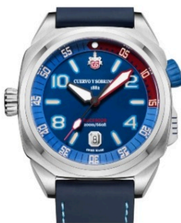
Cuervo y Sobrinos Buecedor Caribe $3,500